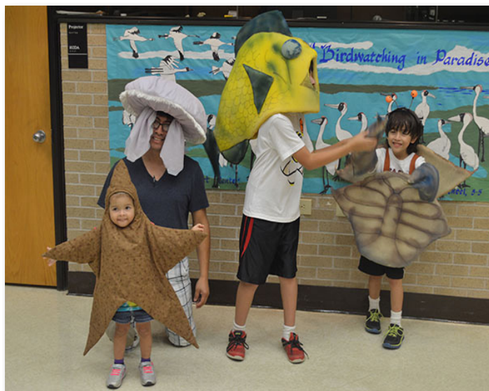
Visitors are wild about estuaries.

needed in our workforce. Ocean science is not a course generally offered at the high school level, but this opportunity combines high school science and math in a format that is both exciting and challenging. The NOSB is one of the few ways students gain exposure to all of ocean science and related careers as they are beginning to chart their course in life. This year, Brandeis High School from San Antonio took the top honors. They will go on to compete at the National Ocean Science Bowl on April 21-24, 2016 in Morehead City, North Carolina at the University of North Carolina Institute of Marine Sciences. Harlingen High School – South Team A received second place, Gregory-Portland High School Team A received third place and McAllen Memorial High School Team A received the award for best sportsmanship.