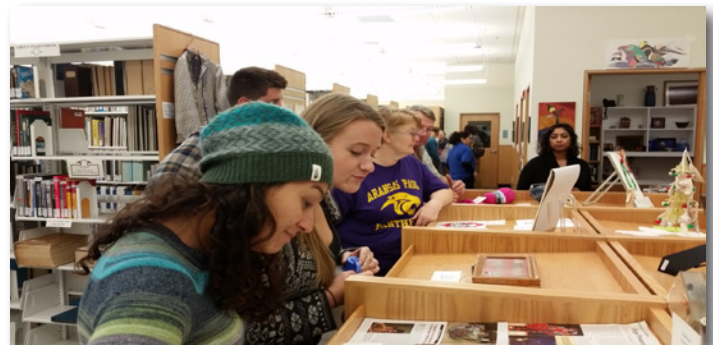
Staff and students view submitted art at the Annual Library Arts and Crafts Holiday Party.