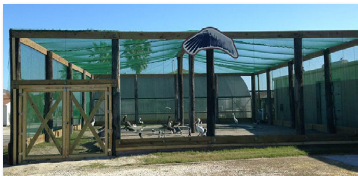
The new pelican enclosure keeps injured pelicans in and the healthy (but entrepreneurial) pelicans out.