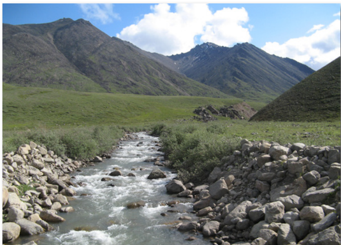
Arctic rivers are primary mechanism that black carbon is transported to the ocean.

reveals that the black carbon stored in Arctic soils is being exported to the oceans. Once dissolved in the ocean and exposed to sunlight, black carbon may be rapidly converted back to the greenhouse gas carbon dioxide. The results of their study were recently published in the journal Frontiers in Earth Science , lead author Aron Stubbins. The scientists are now continuing to determine just how much black carbon will be exported to the Arctic Ocean as the Arctic continues to warm, and once it reaches the oceans, what percentage will reach the atmosphere as carbon dioxide. This work is supported by the National Science Foundation and the Hanse Institute for Advanced Studies.