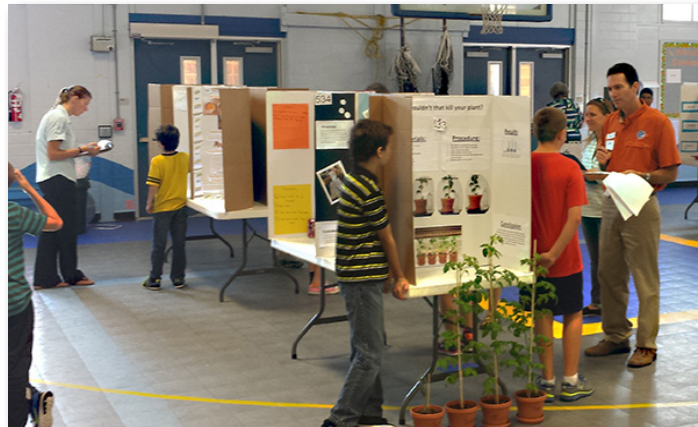
The 2015 Science Fair at the H.G. Olsen Elementary School in Port Aransas was a success.

The Port Aransas Science Fair occurred this November, which was a culmination of six weeks of research and experimentation by 4 th and 5 th grade students at the H.G. Olsen Elementary School in Port Aransas, Texas.